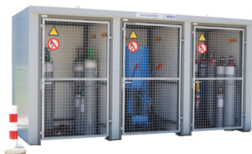
Afgebeeld met 2x F60 scheidingswand (= optioneel)